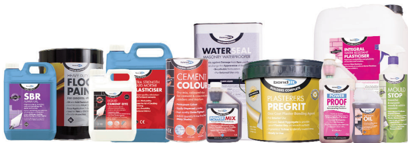
Part of the Bond It Builders Complete Range

The data presented in this leaflet are in accordance with the present state of our knowledge, but do not absolve the user from carefully checking all supplies immediately on receipt. We reserve the right to alter product constants within the scope of technical progress or new developments. The recommendations made in this leaflet should be checked by preliminary trials because of conditions during processing over which we have no control, especially where other companies raw materials are also being used. The recommendations do not absolve the user from the obligation of investigating the possibility of infringement of third parties rights and, if necessary clarifying the position. Recommendations for use do not constitute a warranty, either expressed or implied, of the fitness or suitability of the products for a particular purpose.